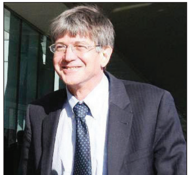
U.S. Deputy Secretary of State James Steinberg arrives at the Ministry of Foreign Affairs of South Korea in Seoul, capital of South Korea, on Jan. 26, 2011.

WASHINGTON, — U.S. Deputy State Secretary James Steinberg will resign from his post, State Secretary Hillary Clinton said on Wednesday.