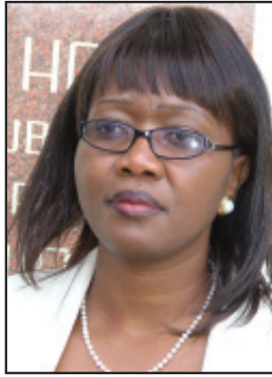
Hon. Saara Kuugongelwa-Amadhila

An additional 82,000 new job opportunities would be realised