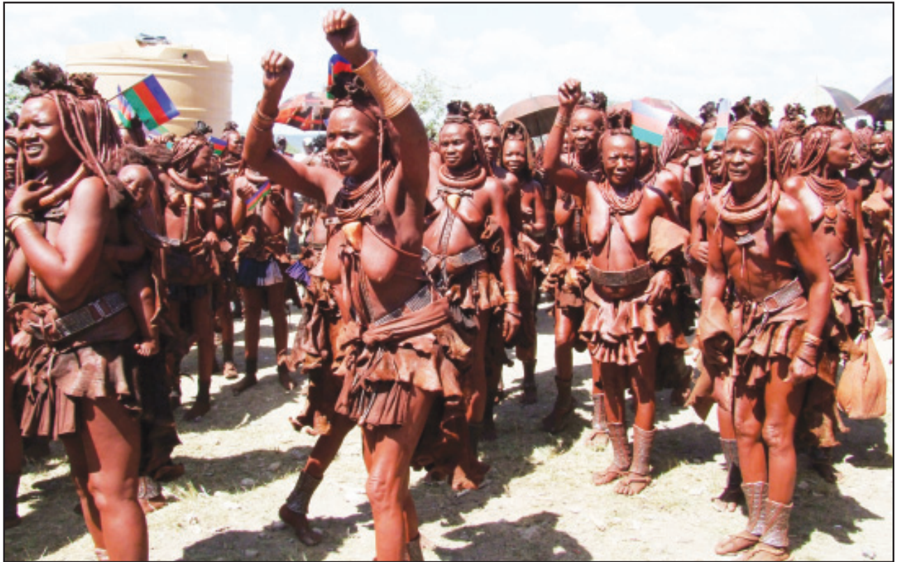
The battle for Kunene Region – SWAPO Party sets its eyes on all the six constituencies. It currently only controls one constituency, Outjo. These are some of the thousands of people who have joined SWAPO Party.