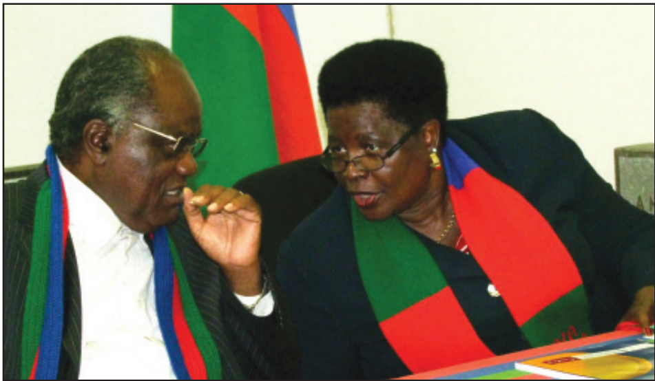
President Hifikepunye Pohamba and SWAPO Party Secretary General, Cde Pendukeni Iivula-Iithana at the launch of the National Preparatory Committee on Wednesday.