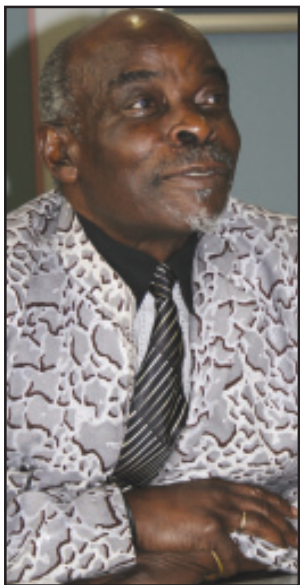
Cde. Nahas Angula

as many people as it deems fit and will meet as regularly as they possibly can. President Pohamba said that with elections only a few months away, SWAPO Party must prepare well and comprehensively to achieve the highest levels of readiness to enable the Party to