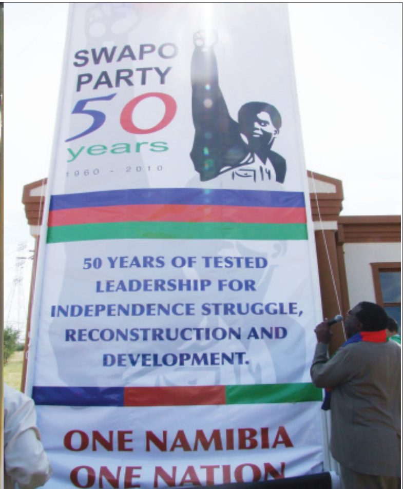
This is the logo that will be used to celebrate SWAPO Party's 50th Anniversary. The logo was unveiled by Vice President, Dr Hage Geingob.