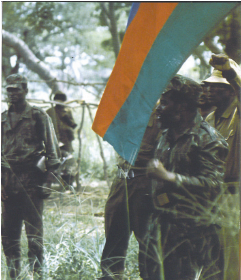
Commander-In-Chief of PLAN, Dr Sam Nujoma, addressing PLAN combatants during the liberation struggle. Those difficult days. Dr Sam Nujoma in the bush during the struggle for Namibia's independence.

waged between 1966 and 1989, fight against the South African Army, which was one of the Namibians to soldier on in their