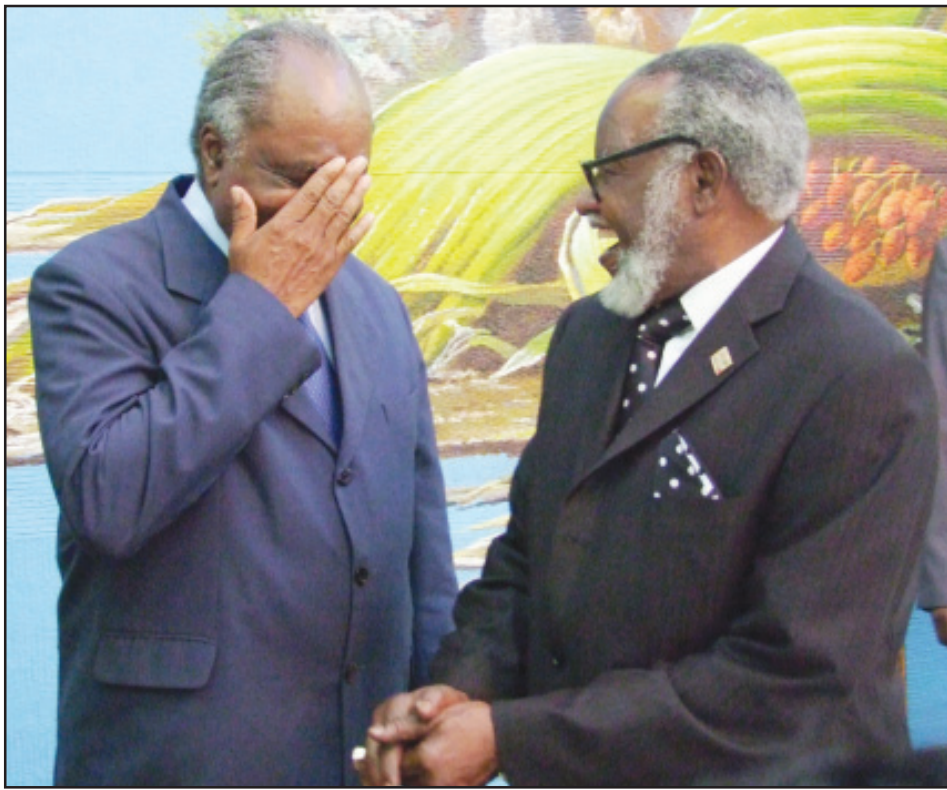
President Hifikepunye Pohamba's surprise birthday luncheon in pictures.