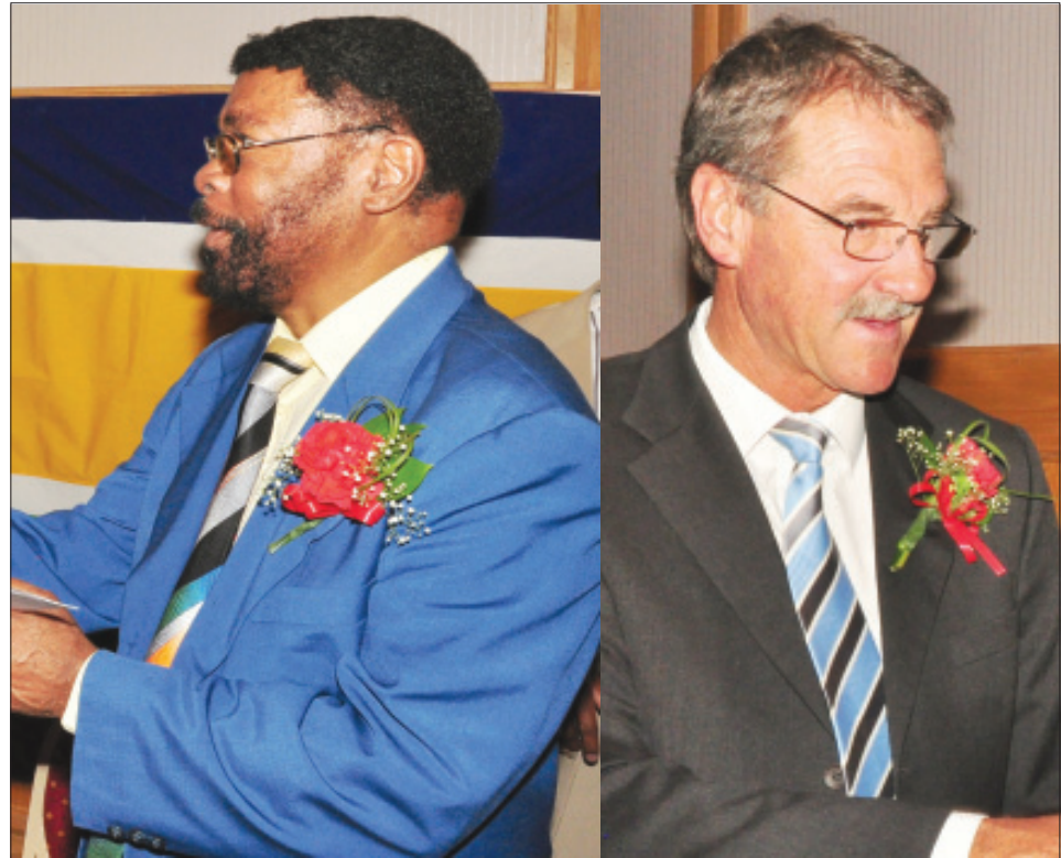
Back to back. RDP President Hidipo Hamutenya and RP President Henk Mudge could not go on honeymoon. The political marriage is over.

"Due to the decision by the Congress that the Republican Party be dissolved and due to the fact that a number of Management Committee members of RP will have to take up membership of RDP on or before October 18, 2010, in order for them to be registered as RDP candidates for the upcoming regional council and local authority elections, the Management Committee has taken a resolution that full Power of