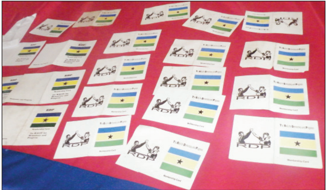
RDP membership cards which were handed over at the SWAPO Party star rally

In his address, President Pohamba, who appealed to