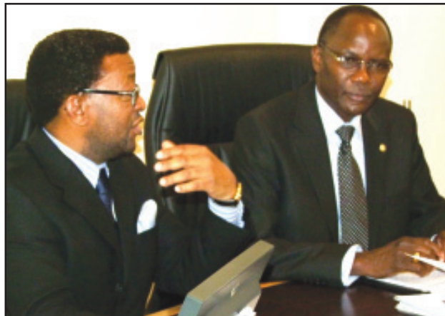
Rector of the Polytechnic, Dr Tjama Tjivikua, and Education Deputy Minister, Dr David Namwandi during the inauguration of the new Council on Wednesday.

The term of the old members of the Council expired early this month and new ones had to be appointed. Only two members, Niilo Taapopi, from the City of Windhoek and Dr Louis Burger, from the Farmers Union, were retained from the old Council. The Rector and the