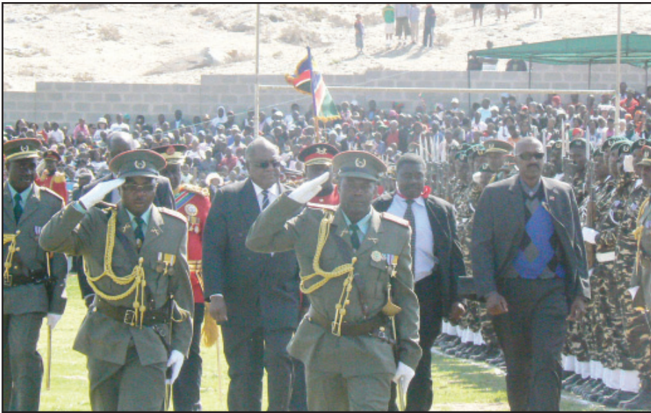
President Hifikepunye Pohamba inspecting the Guard of Honour at Luderitz Bay Sports Stadium to commemorate Heroes Day on Thursday.

What to do when your hair falls out. Page - 6