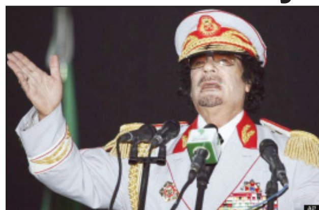
Colonel Muammar Gaddafi