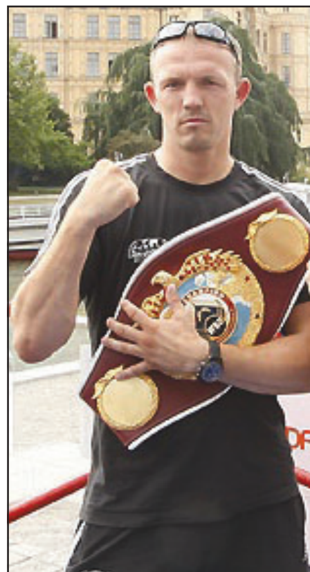
WBO light heavyweight world champion Juergen Braehmer