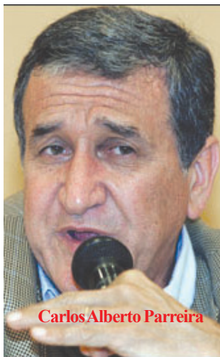
Carlos Alberto Parreira