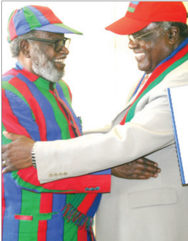
Founding President Sam Nujoma and President Hifikepunye Pohamba.