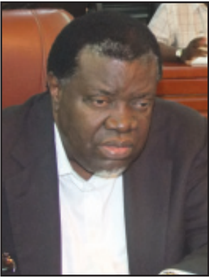
Dr Hage Geingob

After 20 years of independence, it is only appropriate that we reflect on what we have so far achieved in building public institutions, which one of those institutions need improvement particularly to make them responsive to the challenges of the next 20 years, when Vision 2030 is expected to be realized.