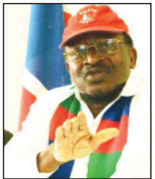
Cde. Jerry Ekandjo

The people of Namibia from all walks of life, irrespective of their race, colour, social status, young and old and of all political persuasions are called to cease this upcoming real occasion, take part and participate in activities marking the 20 th Independence Anniversary Celebration. This particular Anniversary affords us an opportunity to reflect and to take stock of the past as a way to plan for our future. We owe it to ourselves to celebrate our achieve-