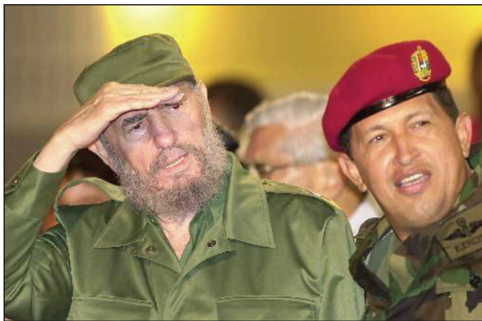
Commandante Fidel Castro Ruz and Venezuelan President Hugo Chavez

"One of the main purposes of increasing tension in the Korean peninsula was to put pressure on Japanese Prime Minister Yukio Hatoyama to make him change his policy on the withdrawal of the US Marine Corps base from Okinawa. Hatoyama has admitted that tensions over the sinking of the Cheonan had a significant influence on his decision to allow the US marines to stay in Okinawa. Hatoyama's decision has caused a split in the center-left coalition government, an event welcomed by