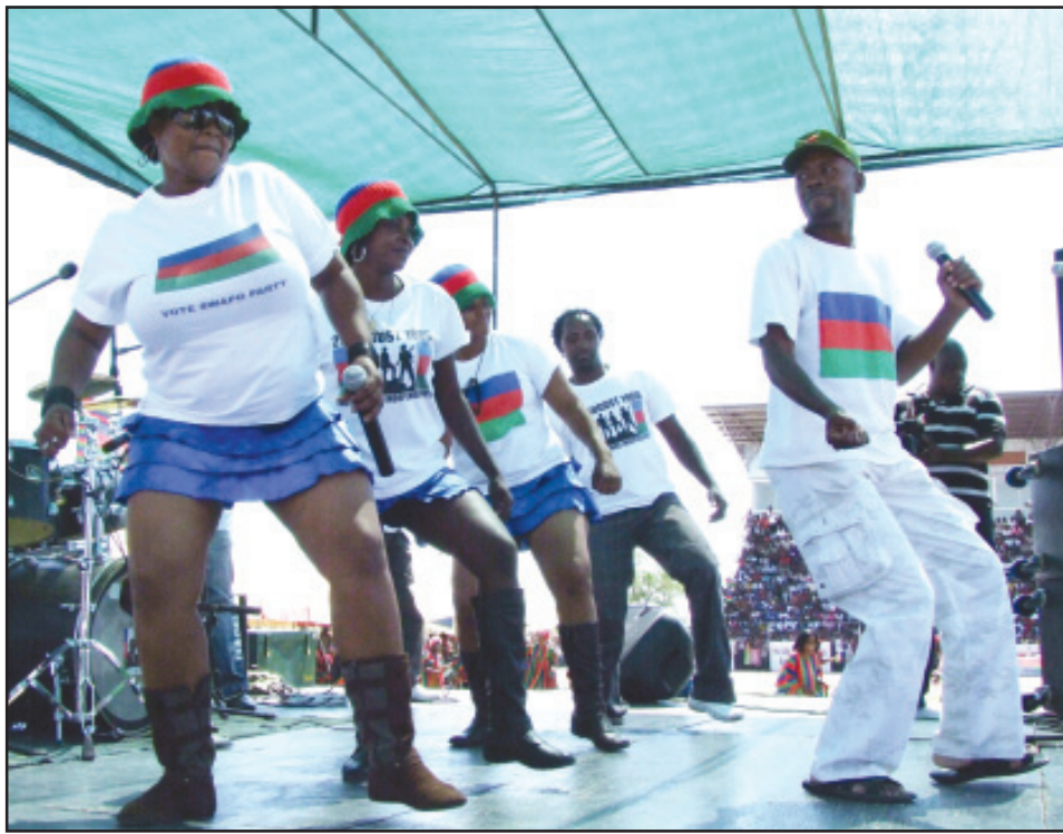
Ndilimani Cultural Troupe performing at one of the SWAPO Party rallies.

He caught almost everybody by surprise when recalled some