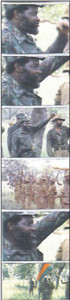
Dr. Sam Nujoma in different motions during the struggle.