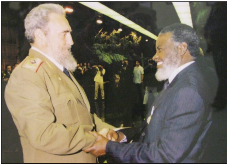
Cuba's Fidel Castro and Founding President Sam Nujoma during Namibia's liberation struggle.