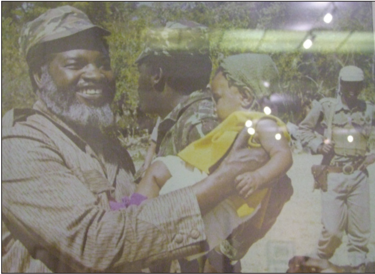
Founding President Sam Nujoma holding one of the Cassinga survivors. Cassinga was a SWAPO transit camp in southern Angola which was attacked by the former apartheid South African regime in May 1978.